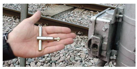
Signal-post replacement key and switch

If the signal is not showing a proceed aspect when you arrive, you must tell the signaller and ask for further instructions.