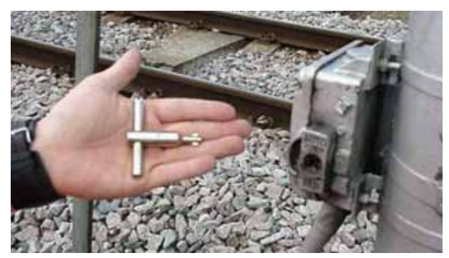
Signal-post replacement key and switch

Although called a SPRS, they are not always on the signal post but will be near to the signal and may be on a separate post.